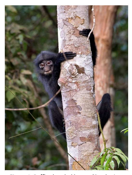
Figure 1. Raffles banded langur ( Presbytis femoralis femoralis ) in Johor.

The banded langur is found in the Malay Peninsula and Sumatra (Groves 2001) and three subspecies are currently recognised: Raffles' banded langur ( Presbytis f. femoralis ) in Johor and Pahang states, Malaysia and in Singapore (Fig. 1); East Sumatran banded langur ( P. f. percura ) in eastern Sumatra; and Robinson's banded langur ( P. f. robinsoni ) in northwest Malay Peninsula, extending north throughout peninsular Thailand and Myanmar (Fig. 2).