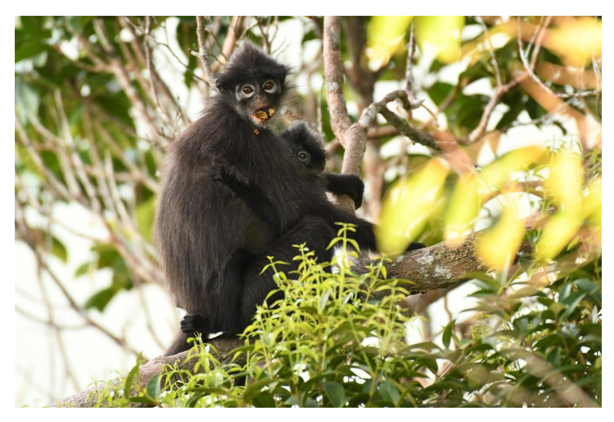
Figure 3. An adult Raffles' banded langur feeding on fruit.